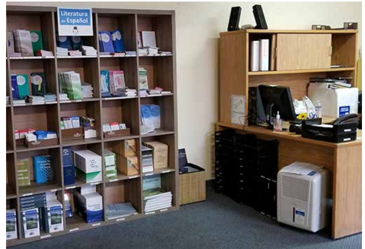
Above: The new Spanish literature section.

to see that members who participated within the group, district and Area seemed to have a little extra spiritual strength and serenity." (pg 273) I know when I step back and look at the new office, I get a few goose bumps from that "little extra spiritual strength" from being a part of the group of volunteers who made our desire for a new, roomier, and cheerier AIS office a reality.