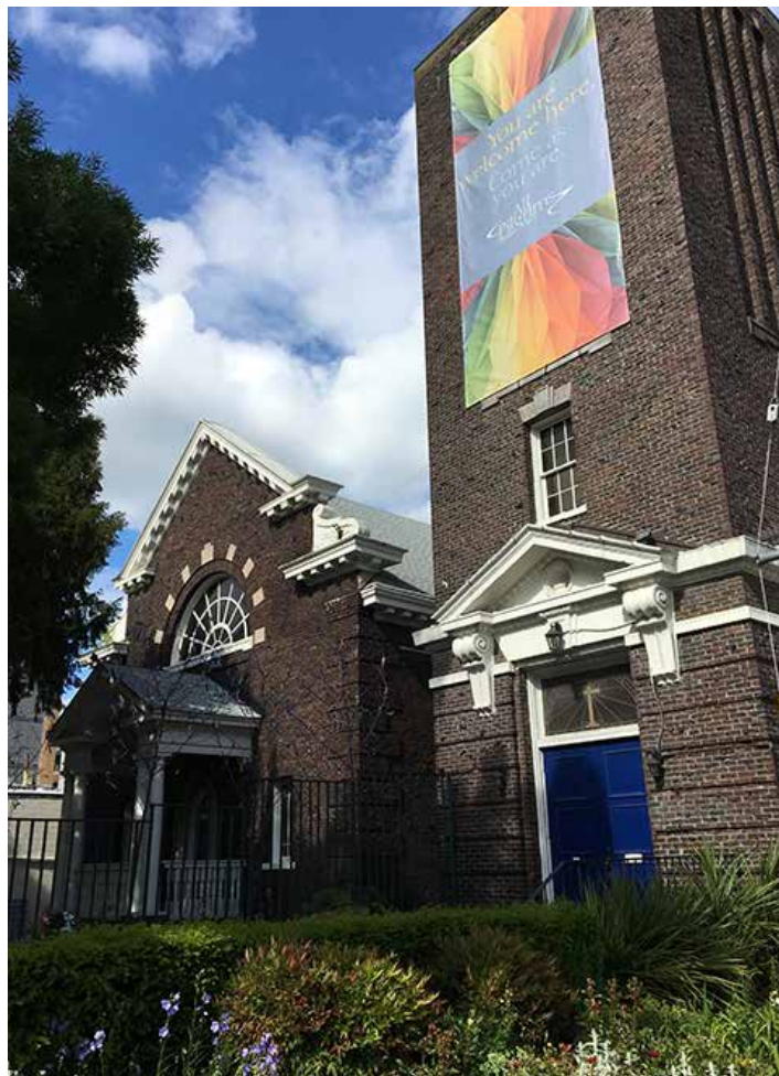
All Pilgrims Christian Church is located on Capitol Hill in Seattle at the corner of Broadway E and E Republican. The AIS office address is around back of the church at 509 10th Ave East, #100, Seattle, WA 98102.