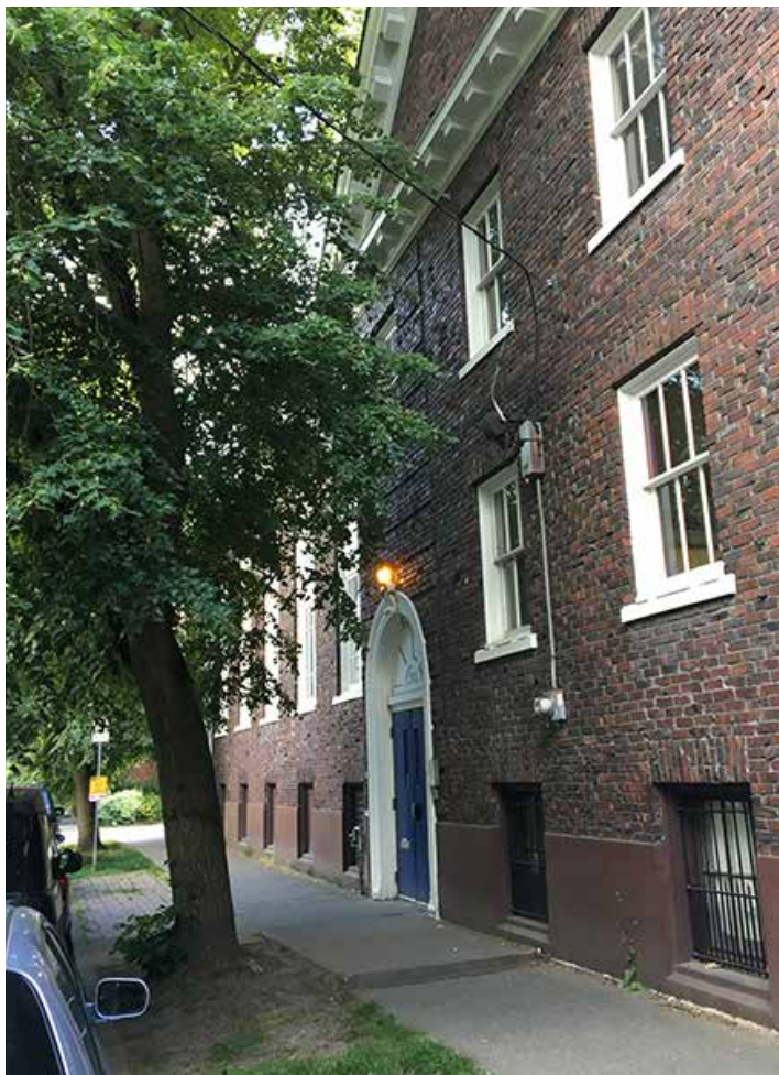
The AIS office will be on 10th Ave E. at the back of the church and through the blue door. Notice the 30 minute load zone sign right outside the door to facilitate easy pick up of literature orders and the bright light above the door for dark winter days.

An Open House celebration will be held on a Saturday once we are settled in. It will be a great opportunity for members to check out Continued on Page 2